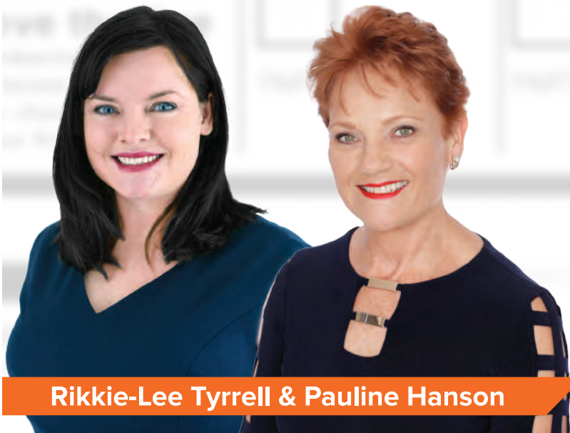
Rikkie-Lee Tyrrell & Pauline Hanson